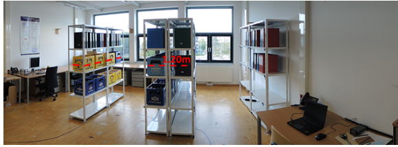
(d) Room B: Picture